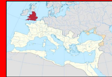
Roman Empire AD 43