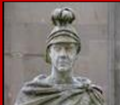
General Julius Agricola